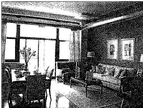
McKinley Park Lofts is an authentic loft conversion of 163 condominiums on Chicago's Southwest Side.

An 88-unit, 17-story high rise, Printers Corner features only cor-